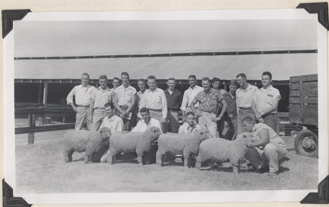
During September, October and November Travis County's State Champion 4-H Livestock Judging team practiced judging with the A and M College senior team. This class of lambs was judged at A and M on Saturday, October 24.