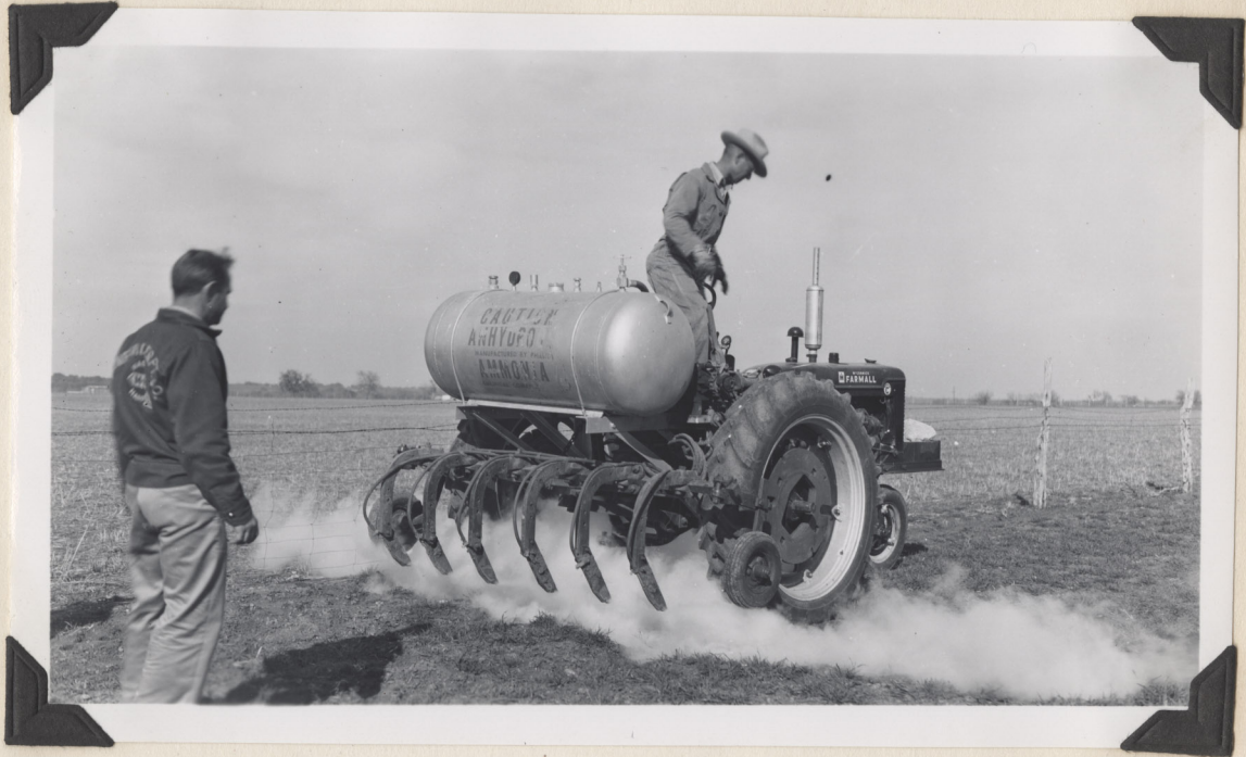
The use of anhydrous ammonia as a source of nitrogen fertilizer on pasture, hay and grain crops was demonstrated to one hundred dairy and livestock farmers of Travis County at a field day in January. Twenty five farmers used nitrogen fertilizers on 2,500 acres for the first time in 1953.