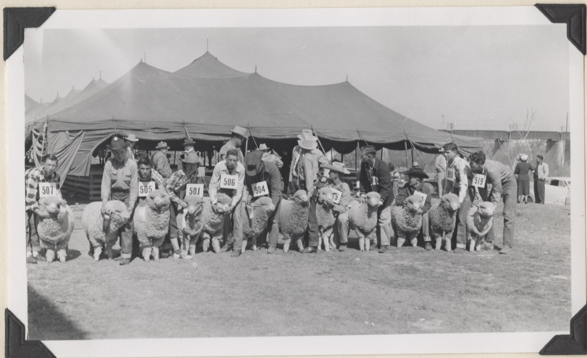
Junior sheep breeders of Travis County have made progress. This class of registered Rambouillet ewe lambs was shown at the Austin Livestock Show last March by 4-H and FFA exhibitors.